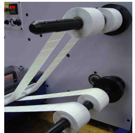
Dual product rewinds