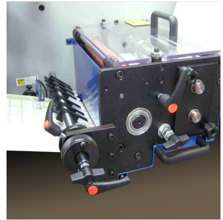
Razor slitting with lateral adjustment