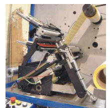
Core and tail gluing